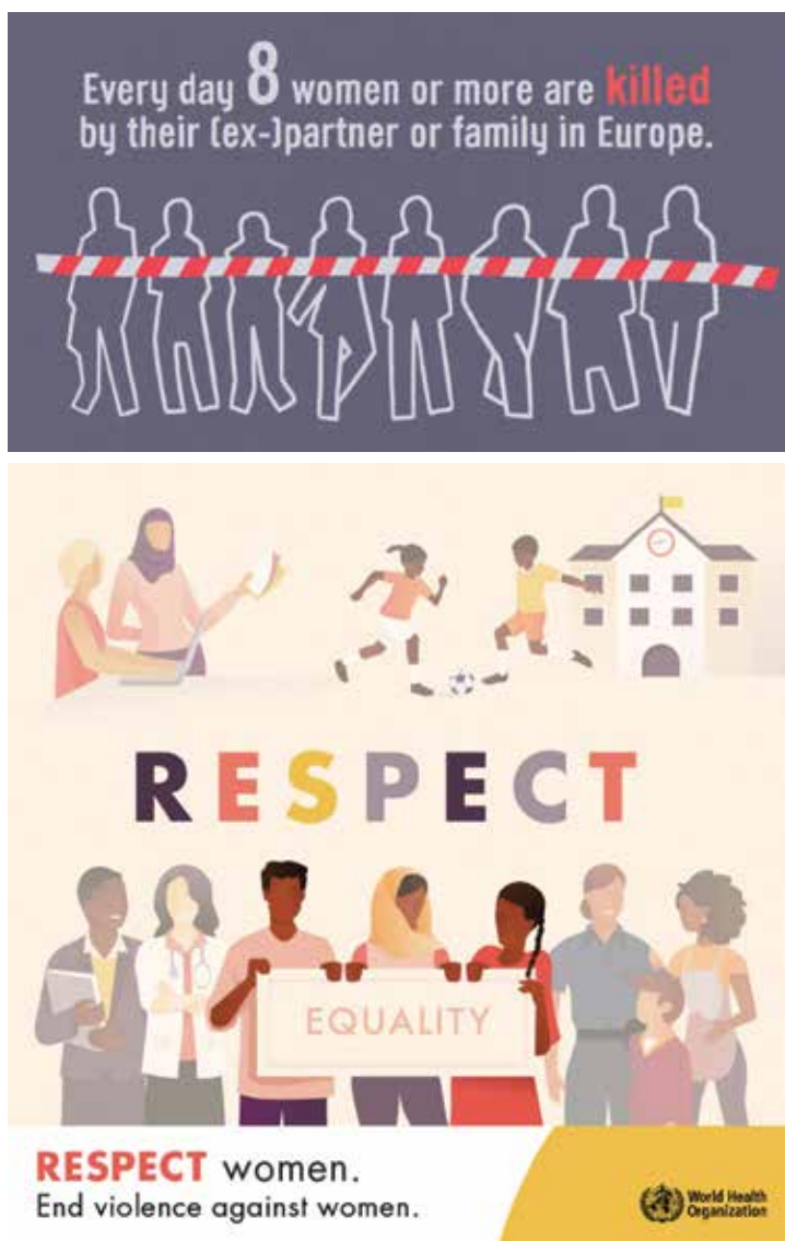
Photo source: IMPRODOVA training modules draw on resources from the World Health Organisation

framework of a successor project, IMPROVE , which focuses on removing barriers that make it difficult for people who are victims of violence to seek help.