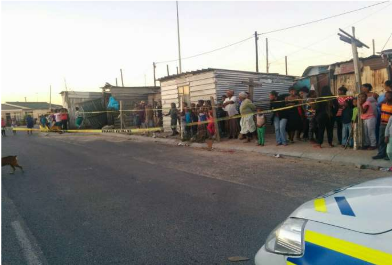
Perkins, G. 2015. Crime Scene. [Photograph](Perkins Private Collection).