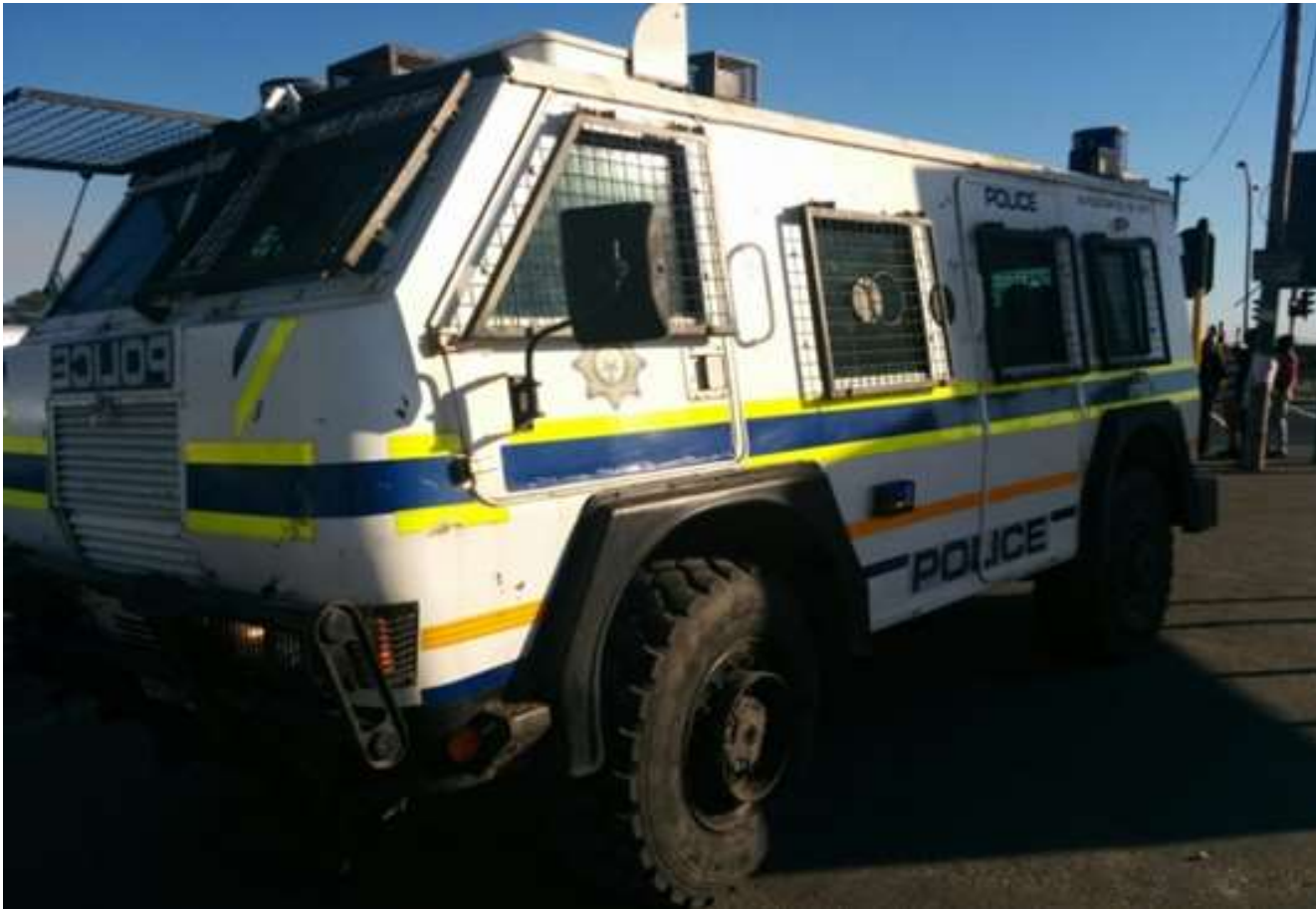
Perkins, G. 2015. Nyala [Photograph](Perkins Private Collection).