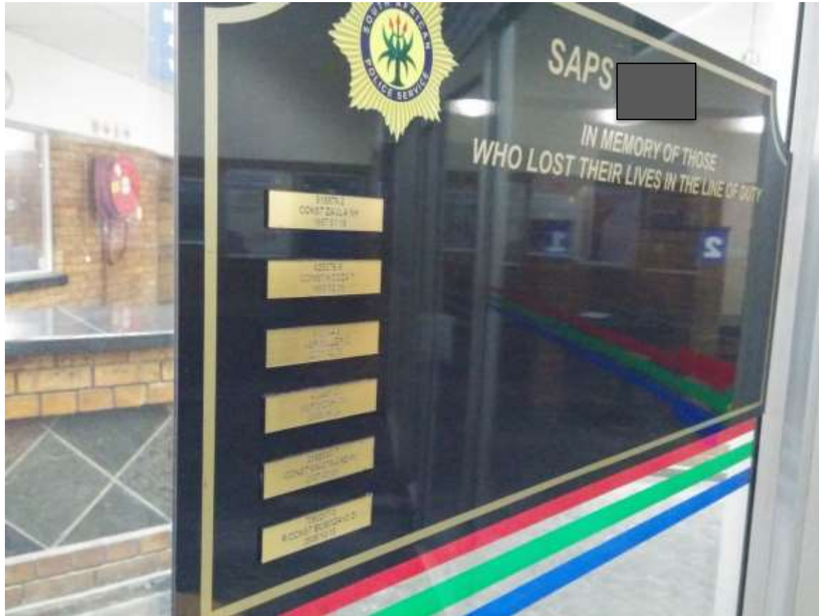
Perkins, G. 2015. Station Plaque[Photograph](Perkins Private Collection).