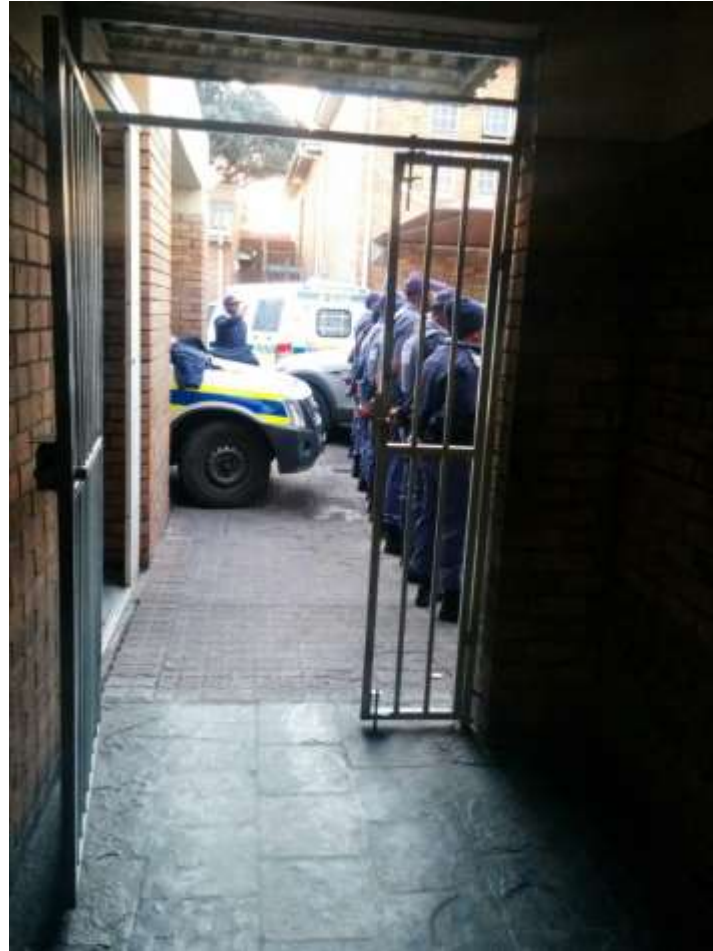
Perkins, G. 2015. Station Parade. [Photograph](Perkins Private Collection).