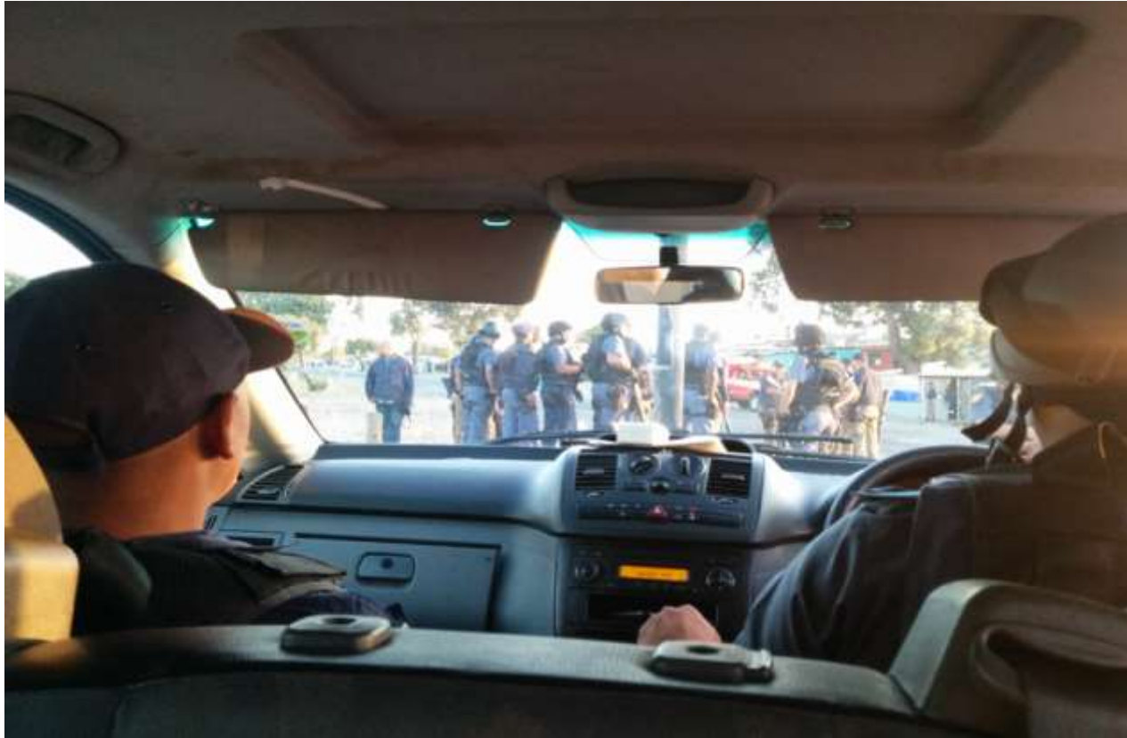
Perkins, G. 2015. TRT Patrol . [Photograph](Perkins Private Collection).