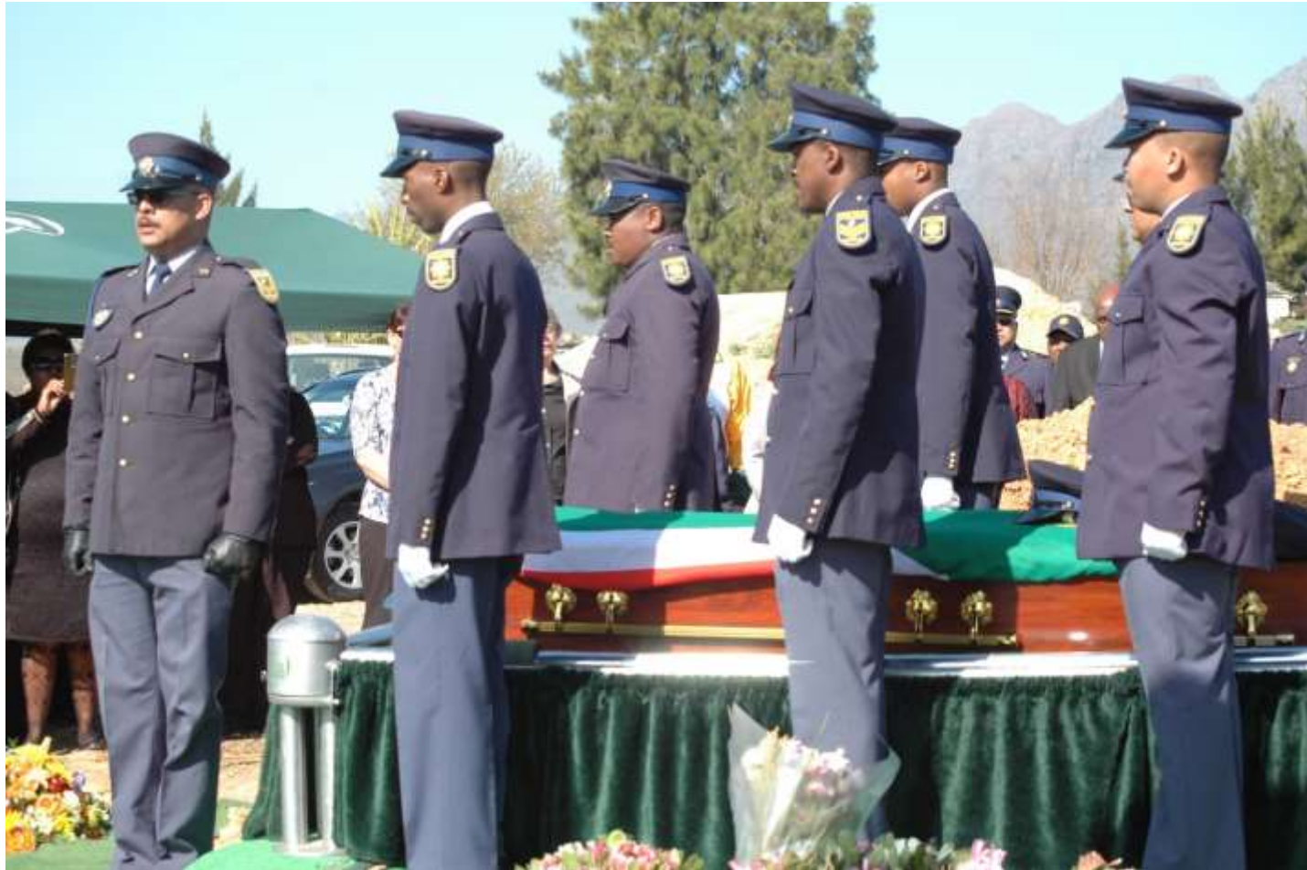
Perkins, G. 2015. SAPS Funeral. [Photograph](Perkins Private Collection).