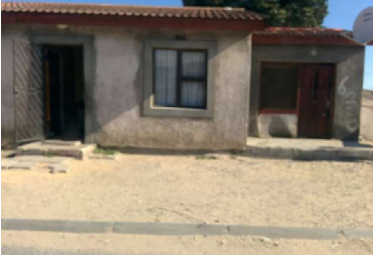
Perkins, G. 2015. Heart House . [Photograph](Perkins Private Collection).