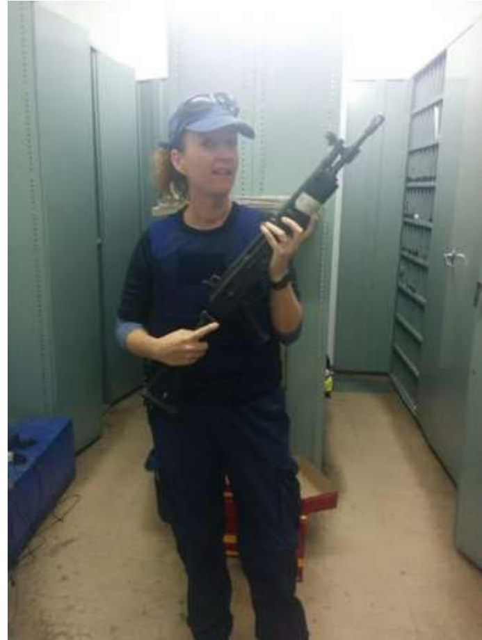
Perkins, G. 2007, 2015. Identities [Photograph](Perkins Private Collection).