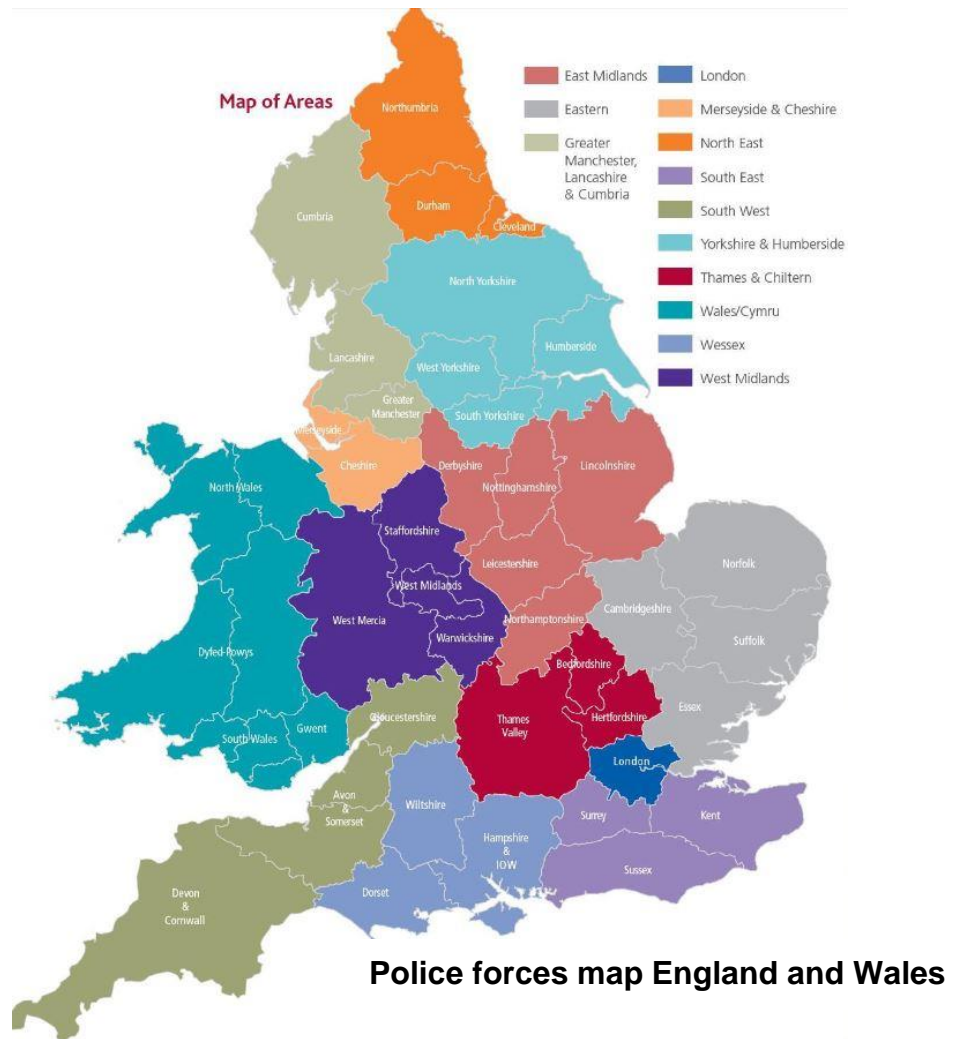
Police forces map England and Wales

The scope of this paper covers police forces within England, however National Statistics illustrate the police workforce as England and Wales combined and so the figures presented below cover all 43 forces across England and Wales.