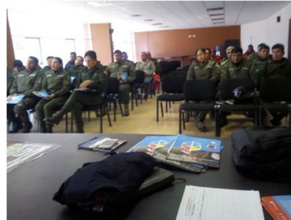
RedTraSex' training sessions in Bolivia